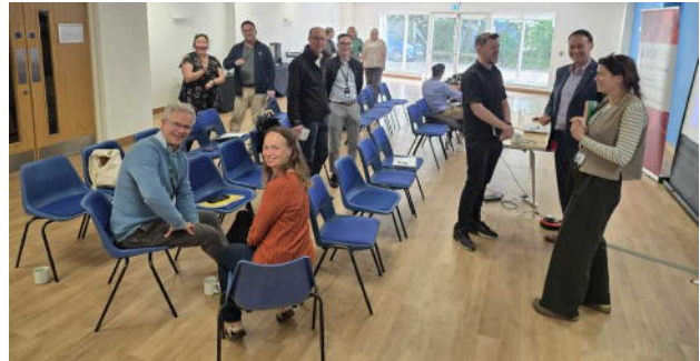
We took the photo after the meeting had concluded, a few familiar faces and a few new ones among this year's STEM Ambassadors.