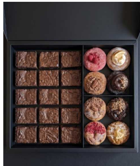
Beautifully gift boxed

The SugarLips philosophy is simple: inclusive luxury. In any room, at any table, dietary requirements should never mean settling for less. One box. Everyone included. Nobody left out.