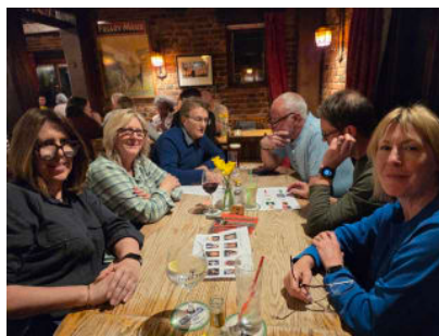
Fresh Display & Friends...