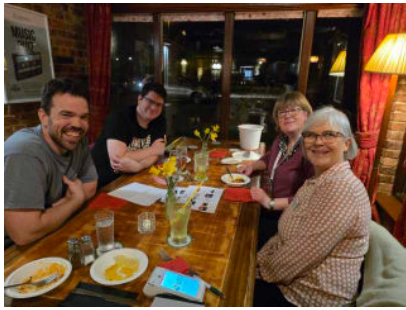
The Hospice team