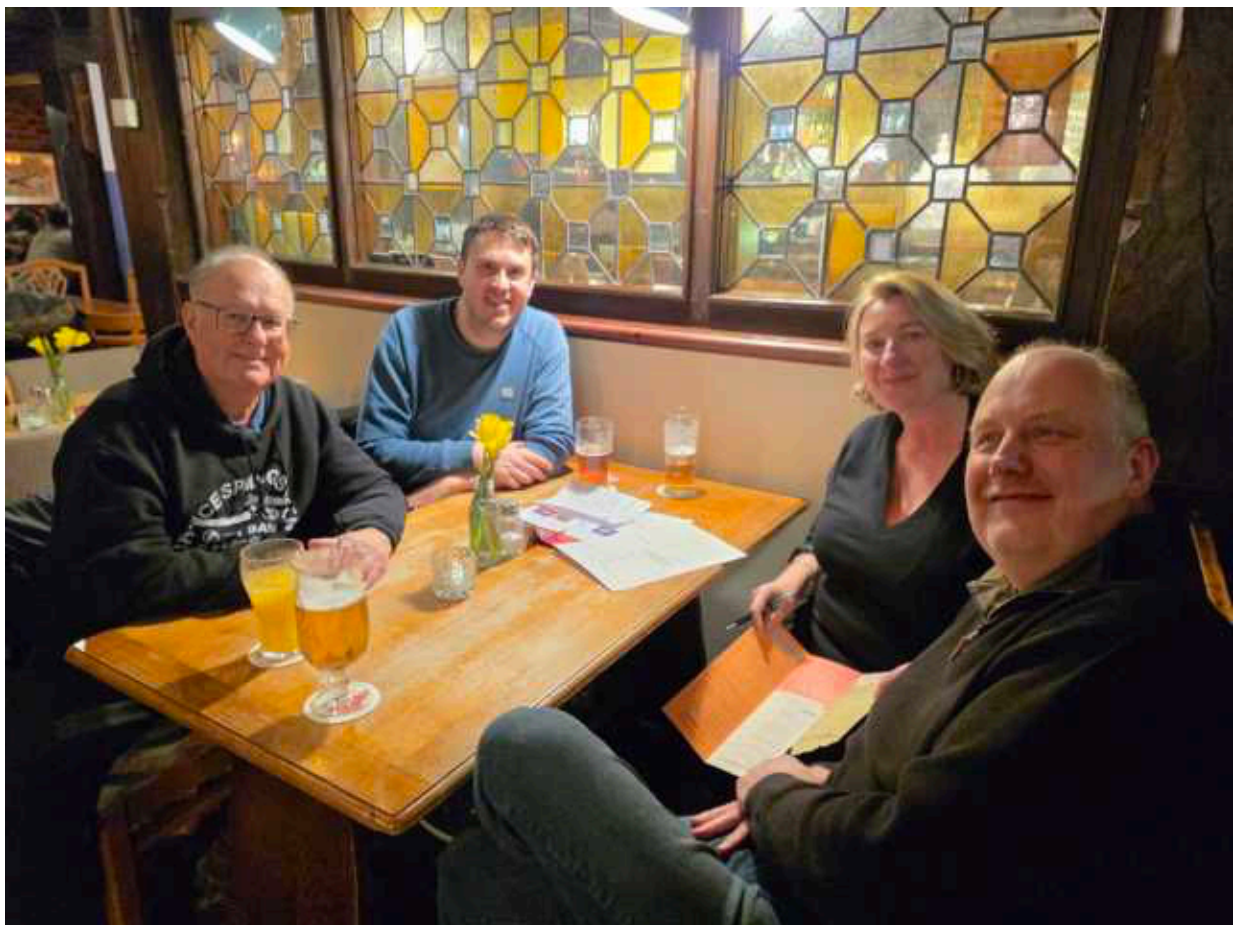
Burgess Hill Town Football Club -Winners of the evening's quiz

Well done to them and everyone else that came out to support a vital part of our local healthcare fabric, St Peter & St James Hospice .