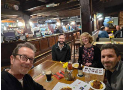
BHBPA's scratch team

I like to thank everyone for the donations to our raffle prizes and a special mention to Certa MPS who couldn't make it last minute but gave a very generous donation nevertheless.