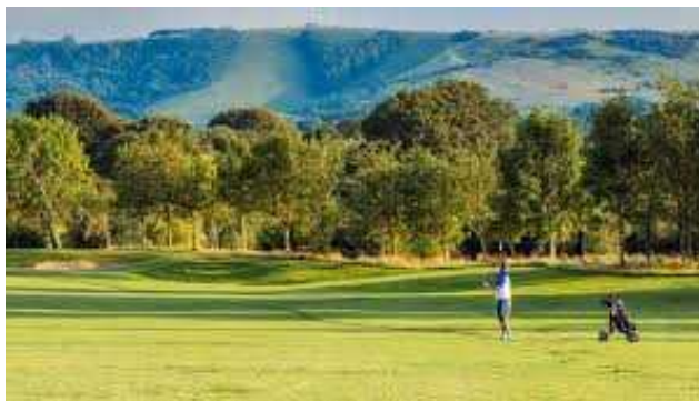
A stunning location - Mid Sussex Golf Club

We'd like to thank Mid Sussex Golf Club for sponsoring a great breakfast buffet of bacon baps and similar. Teas and coffees will also be available for our guests.