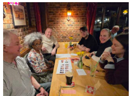
The Escape Youth Club