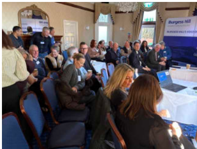
Everyone takes their seats

The UK has a disproportionately large share of activity in AI-exposed industries, meaning it has potential to gain above-average productivity benefits from adoption of AI compared to our G7 competitors, second only to the US.