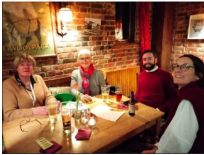
The Usual Suspects (Scratch Team)