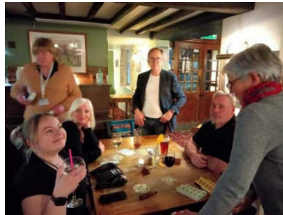
Time 24 fielded another strong team