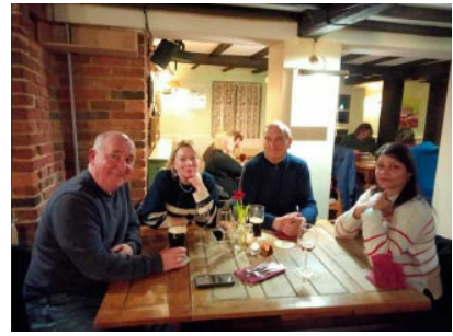
The team from Rewards Training