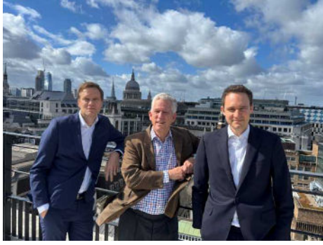
The Handelsbanken Economics Team

We give a brief overview of that presentation here.