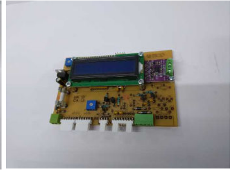
Component-level PCB design

Whether you need a custom control panel, equipment repair, or a complex monitoring system, we provide the problem-solving expertise to keep your business running.