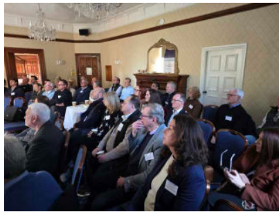
A capacity crowd for this event