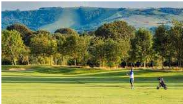
A stunning location - Mid Sussex Golf Club

We'd like to thank Mid Sussex Golf Club for sponsoring a great breakfast buffet of bacon baps and similar. Teas and coffees will also be available for our guests.