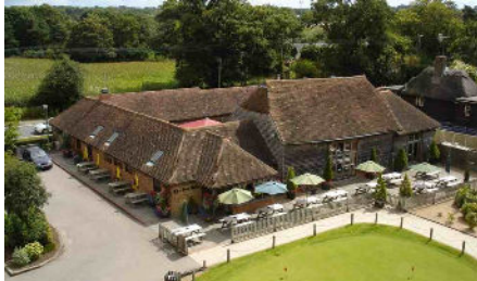
The Oak Barn Restaurant

The BHBPA AGM will be held on Wednesday morning March 26th