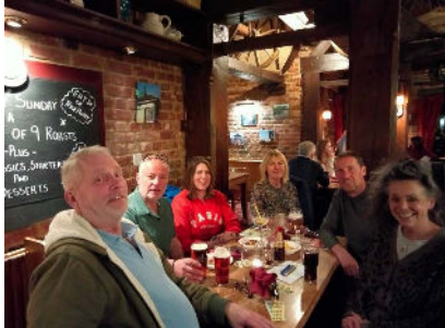
Fresh Display and friends