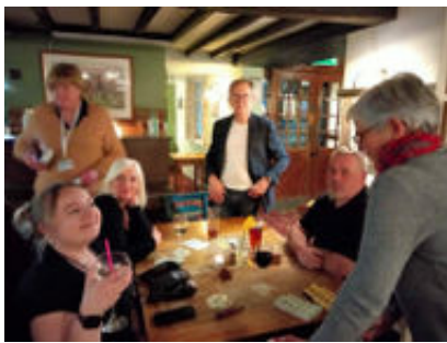
The Time 24 team on form