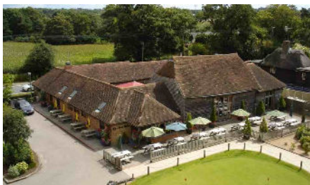
The Oak Barn Restaurant

The BHBPA AGM will be held on Wednesday morning March 26th