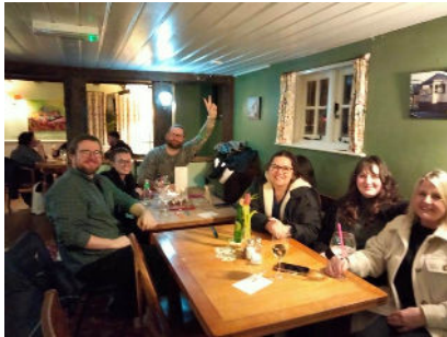
Great turnout from HS Energy