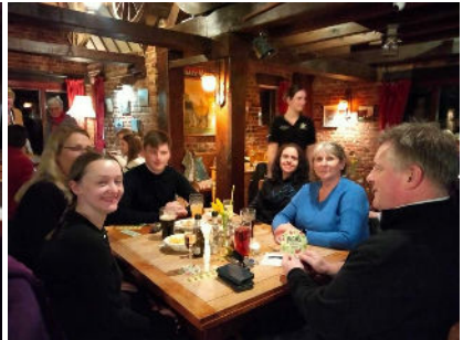
Epassi all being good sports