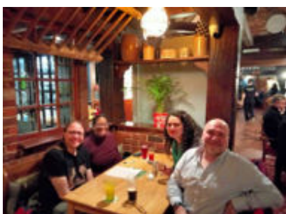
Cybility Consulting Team