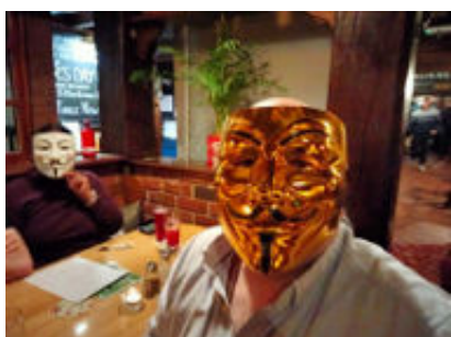
Some cybersleuthing going on