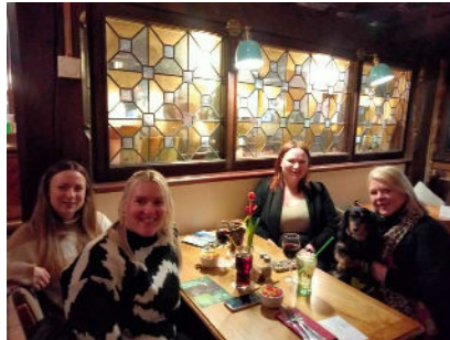
The Travail team