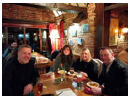
One of two teams from HS Energy