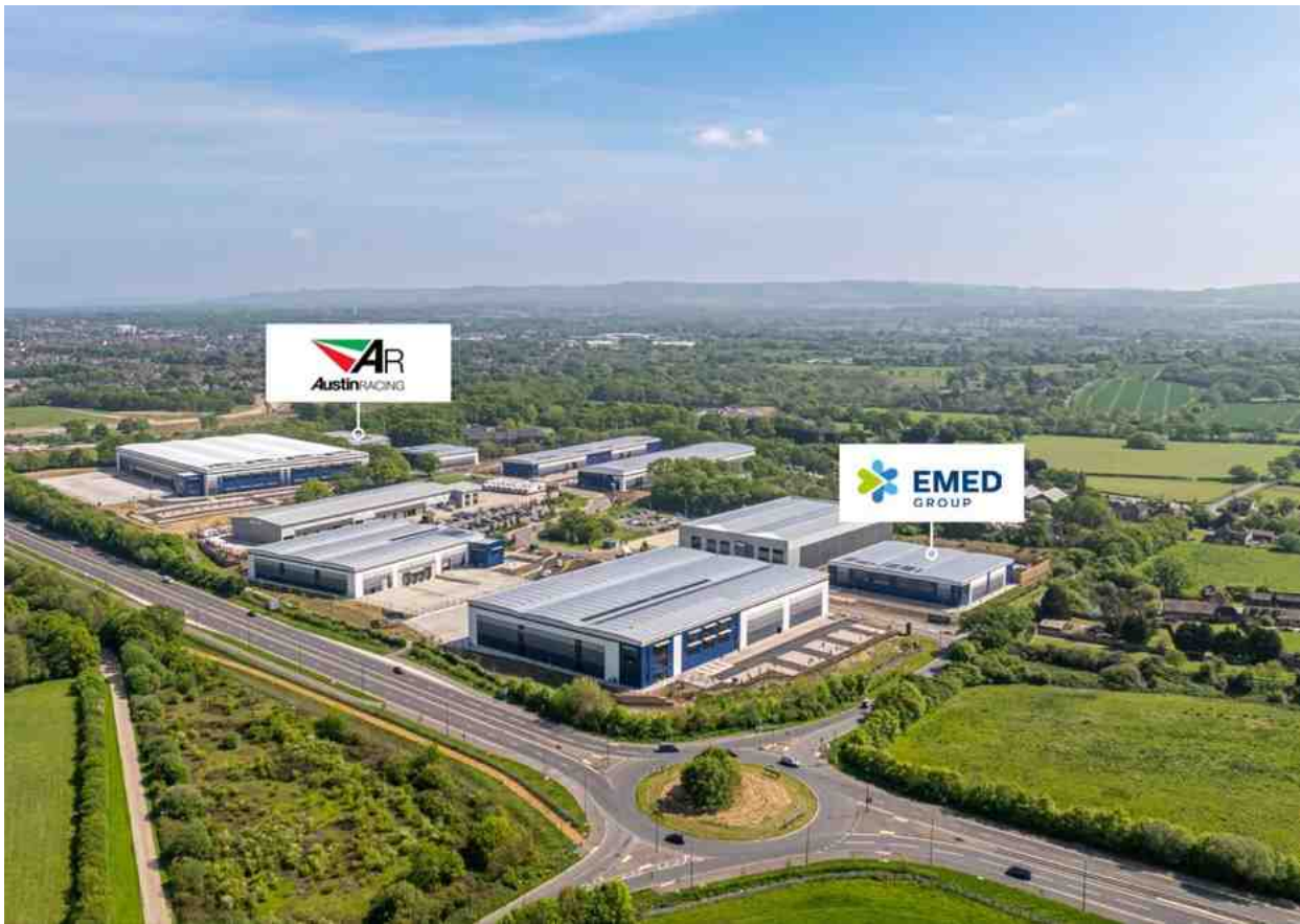
The location of the two new business coming to Burgess Hill