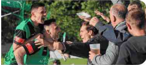
The U18s team will be playing at 7.30pm. It promises to be an exciting match.