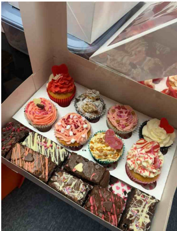
Some very artful decoration

It is a privilege for us to contribute to such an essential cause, and we are incredibly grateful to everyone who played a part in making this fundraiser a success. Whether you spread the word, donated or placed an order, you have helped us help others and we can't thank our community enough. This generosity has made a real difference.