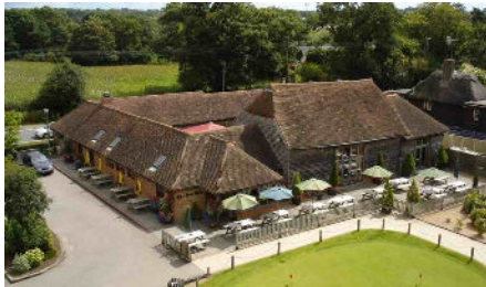
The Oak Barn Restaurant

The BHBPA AGM will be held on Wednesday morning March 26th