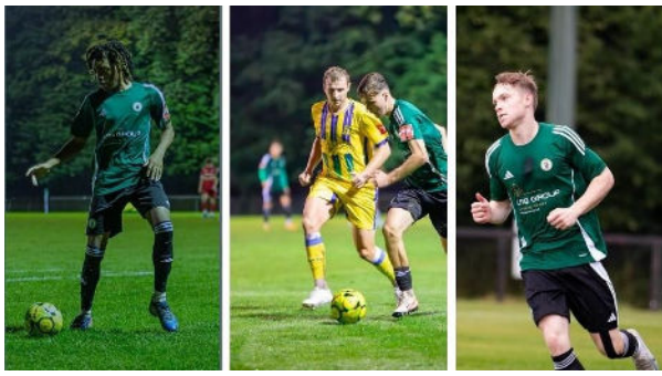
To young men

This included much improved facilities at the club and great looking professional kit. Setting standards is important.