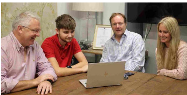
The Sussex Tech Support team

Larger businesses must now demonstrate their commitment to cybersecurity throughout their supply chains. Many now require their smaller suppliers complete the Cyber Essentials Certification—an initiative developed by the UK Government.