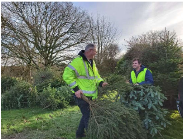
The team from BlueLite getting stuck in.

St Peter & St James Hospice staff and volunteers