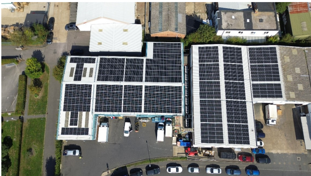
460 panels - the solar PV installation at the Burgess Hill depot

Consort has been mindful of the need to find alternative and greener sources of energy as it operates huge cold stores 24/7, operating at -20 degrees C. Although Auditel have helped secure a 100% Clean Renewable energy supplier (which counts as zero-carbon for foot-printing purposes), Consort wished to go further in reducing its carbon footprint and at the same time protect itself from future price fluctuations in energy costs.