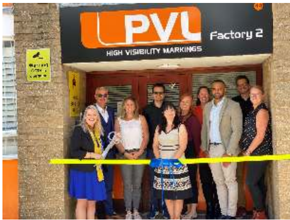
The PVL team outside the factory